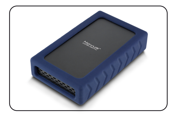
Novus™ External USB-C Drive User Guide